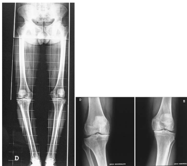
Fig. 2 Pre-operative X-ray show 6° of anatomical varus in the left and 10° in the right leg

An opening wedge osteotomy was planned to obtain 2 or 3° of hypercorrection in the alignment of both knees that is 9