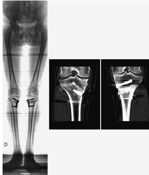
Fig. 4 X-ray and tomogram taken after 12 months of left osteotomy and 4 months after of right osteotomy

Their percentage is dependent upon the sintering treatment, content and the composition of the glass added [27–29, 37, 38]. Due to the presence of HA and \alpha - and \beta -TCP in the structure of Bonelike ® composite, which are known to be biodegradable and bioresorbable phases, a local enrichment in Ca and P in the physiological environment occurs, which stimulates new bone formation helping in osteointegration of Bonelike ® composite as well as improve the mechanical strength.